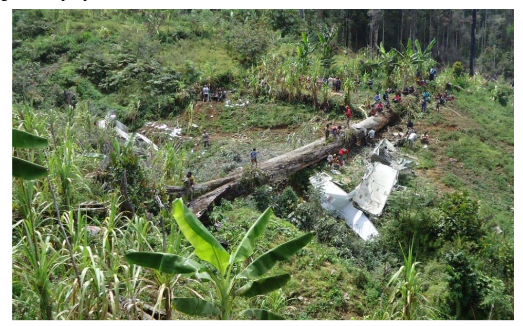
Figure 4: The accident site

The wreckage was in two areas separated by a large tree trunk with the diameter about 1 meter. The fuselage, tail plane, roof and main landing gear were located at northern side of the tree while the wings, nose landing gear, cockpit completed with engine and propeller were situated at southern side of the tree.