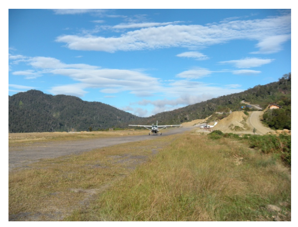
Figure 1: The typical of Cessna 208B Grand Caravan

The aircraft continued climb and headed left. It was reported while the aircraft initially was climbing with the nose up but following lost altitude. The aircraft bank to the right and crashed on a corn farm on coordinate S 03 44.58 E 137 0.96 with altitude about 6550 feet on heading about 260 degrees. The aircraft was destroyed on impact with the ground. The captain seriously injured and still on seat in the aircraft wearing the shoulder harness. The second in command was fatally injured outside of the aircraft at the crashed site.