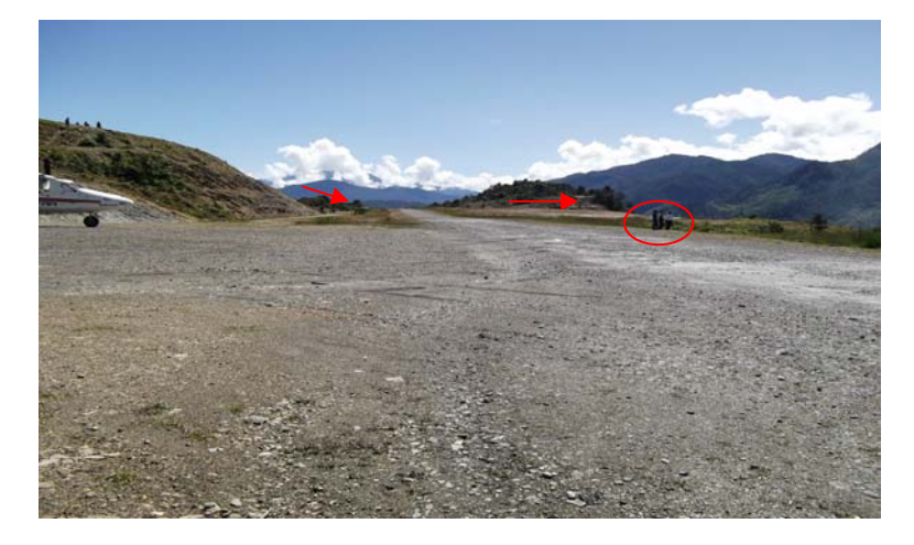
Figure 2: The walking direction of local people

There were no fences and no warning sound signal/sirens to alert the local people which on the runway area during aircraft takeoff and landing.